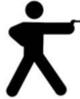
Active Shooter Preparedness