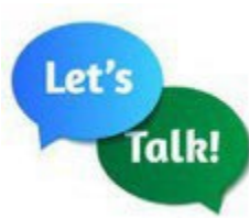
Counseling and Testing