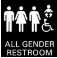
All Gender Restroom