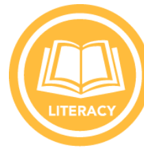
Center for Literacy

All information on WKU policies in class syllabi can be found here