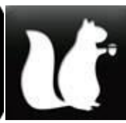
Student Resource Portal