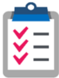
Student Code of Conduct