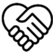
Student Complaint Procedures