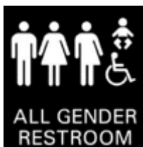
All Gender Restroom