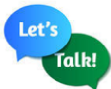
Counseling and Testing