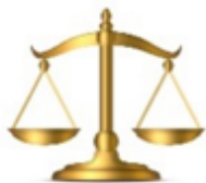
Student Grievance Procedures