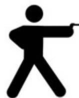
Active Shooter Preparedness